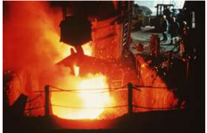
SWEPACO 123 Ultra EP Multi-Service Grease is perfectly suited to bearing applications, like this steel plant, where extreme loading and high heat are primary concerns.

This state-of-the-art gelling system also yields superior mechanical stability, an inherently high dropping point, reduced wear and excellent resistance to water and corrosion.