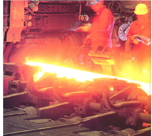
SWEPCO 104 High Heat Grease is especially formulated for superior lubrication under a wide range of high temperature applications.

SWEPCO 104 has been carefully formulated to withstand the demanding lubrication requirements of high heat applications. It is a careful blend of the