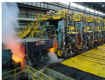
High Heat Applications

SWEPCO 104 provides safe, dependable lubrication at constant temperatures up to 450°F (232°C) and