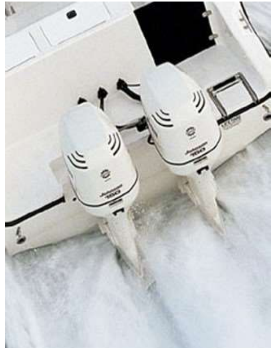
SWEPCO 313 provides unexcelled protection and cleanliness.

SWEPCO 313 TC-W3 is designed for use in engines featuring more advanced technology and extends the previously proven TC-W/TC-W2 technology and beyond. It provides an extra margin of lubrication safety which