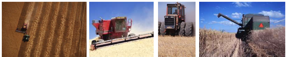
SWEPCO 709 provides superior lubrication of hydraulics in all types of agricultural equipment.

Modern agricultural equipment is expected to handle tougher jobs than ever before. They require lubricants which will properly protect them under increased demands of load, speed and temperature.