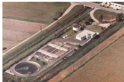
WTP & Other Corrosive Conditions

This highly effective moly film provides an extremely durable second layer of lubrication which reduces friction and drag well below levels