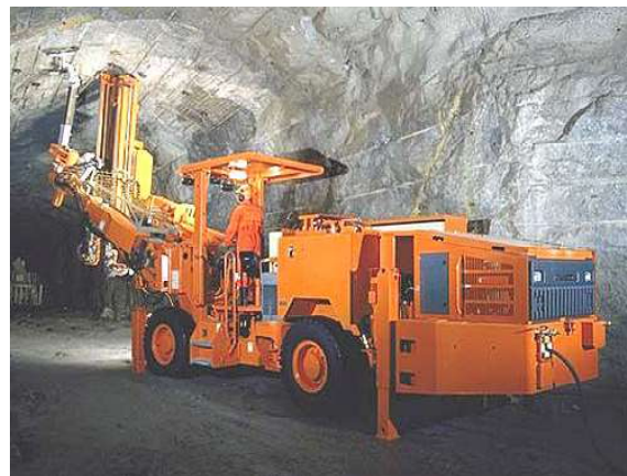
Many industries, such as underground mining, need high performance hydraulic oils which are also fire resistant. SWEPACO 770 Fire Resistant Hydraulic Fluid is the perfect answer.

SWEPACO 770 is compatible with most mineral oil, ester, and polyol ester based fluids.