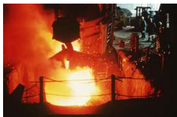
Foundries & Smelters